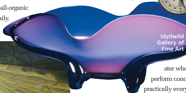
Idyllwild Gallery of Fine Art

SOCIAL CLIMBERS Idyllwild is among the best places for hiking in the U.S.; we're connected to the 2,650-mile Pacific Crest Trail.